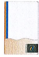
Standard RR Stock